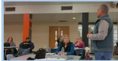
← MHAction inaugural LCT in Williston, ND, in February.