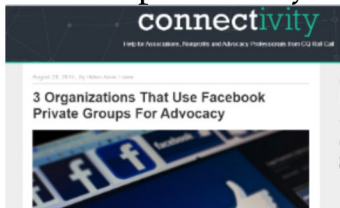
Article on MHAction from Congressional Quarterly

https://www.facebook.com/MHAction – MHAction’s Facebook page grew by leaps and bounds this year, and now has more than 11,000 followers. In addition, MHAction helped local groups and homeowner associations set up Facebook public pages and private groups in six states. MHAction’s use of Facebook as an organizing tool received national press this year!