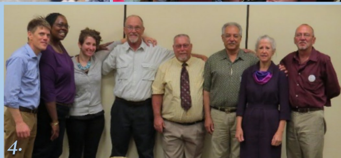
4. MHAction leaders and staff from six states attended the Equity Lifestyle Properties 2015 shareholder meeting in May.