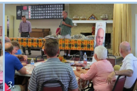
3. MHAction leaders and staff at presentation and training with homeowners from SUN Communities in Orlando.