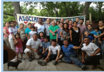
← MHAction bilingual LCT in North Lamar, Texas, in July with the Asociacion de Residentes de North Lamar .

MHAction is a special project of the Center for Community Change. The Center’s mission is to build the power and capacity of low-income people, especially low-income people of color, to change their communities and public policies for the better. Right now, we’re empowering the people most affected by injustice to lead movements to improve the policies that affect their lives.