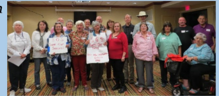
→ MHAction LCT in September in Arcata, Calif., with the Humboldt Mobilehome Owners Coalition .