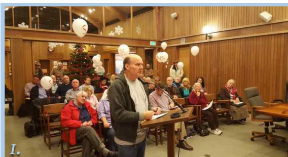
1. Manufactured homeowners in Calif., testifying before the Arcata City Council in December on lot rent stabilization.

Engaging in National Campaigns - MHAction hosts national conference calls and talks on key issues that effect our lives, such as the protection and expansion of Social Security and creating an economy that works for all of us.