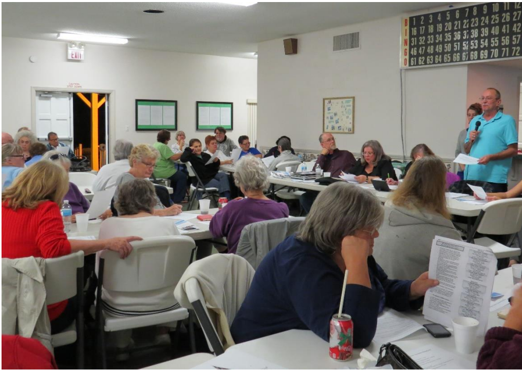
MHAction Leadership Cross Train in Orlando, FL